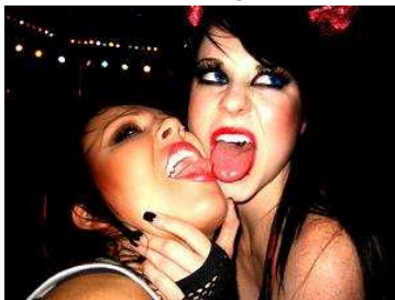
Dear to my Heart ♥ MY TWIG ♥