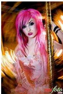
I adore this model!

All of my photographers are wonderful and all have a technique they have developed for themselves.