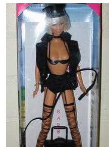
I teach Barbie sex classes. I corrupt children. =)

DO NOT message me if it has NO purpose. i am a HATEFUL BITCH. fuck ▾